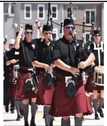
RIGHT: Marching from the former fire house to the new home of the Phoenixville Fire Department