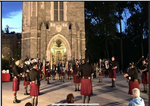
LEFT: George Washington Memorial Chapel in Valley Forge National Park.