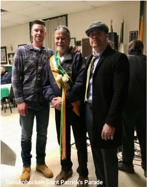
Conshohocken Saint Patrick's Parade