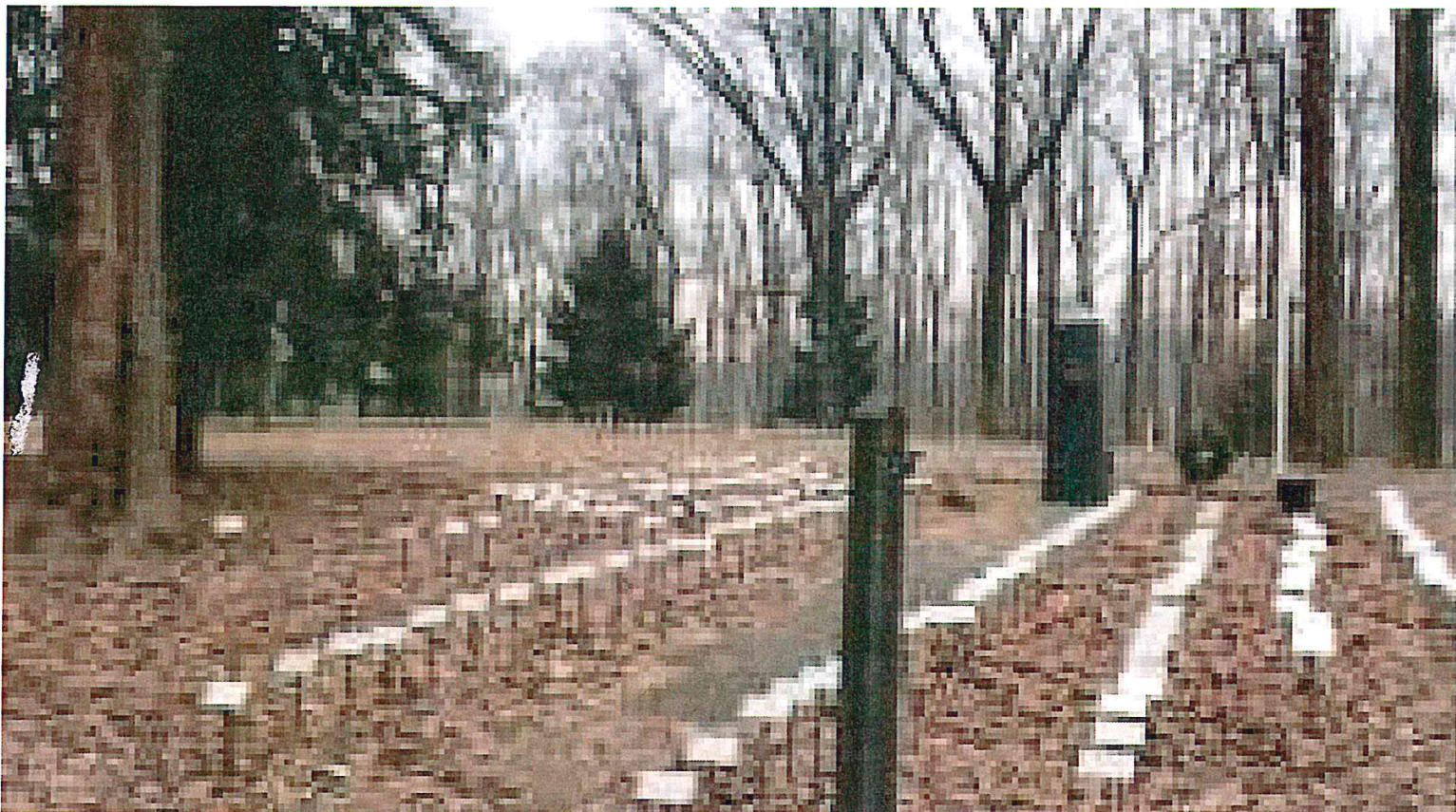
Pennsylvania Area in the Medal of Honor Grove